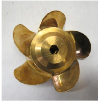
Photos of Kappel propeller and PBCF models tested in Krylov State Research Institute at Saint Petersburg for Danaos 8100 teu vessels built in SHI shipyard