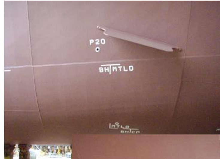
Fins on Danaos 4250 teu vessels built in SHI shipyard