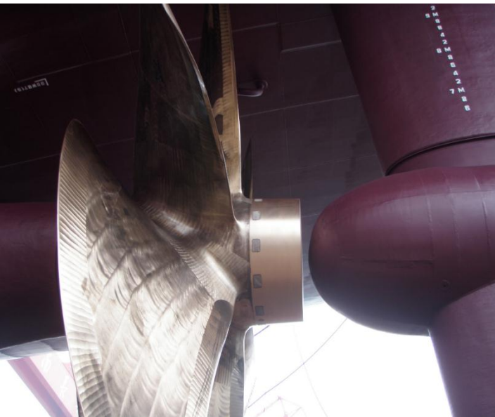
Rudder bulb on Danaos 8500 teu vessels built in Jiangnan shipyard